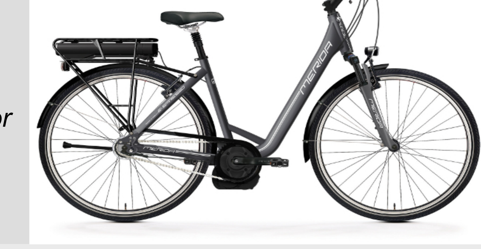
Figure 1. Image of an e-bike

An e-bike is a pedal assist bike with a motor